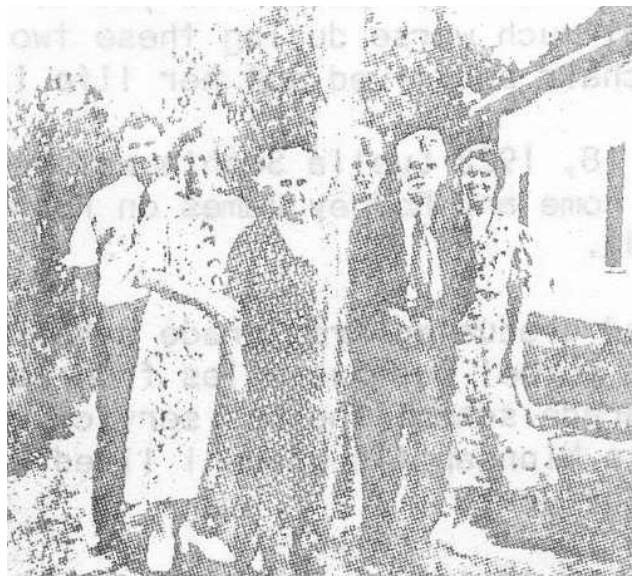
Grandma and Grandpa – 50 th Anniversary Celebration

schoolhouse was the site of all social activities, Farm Bureau, 4-H activities, Christmas programs and church services on Sunday. The community had about eight families at most during this time and the mill provided the only payroll.