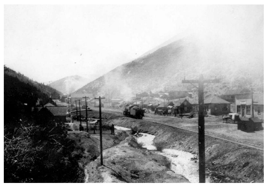
Winter Quarters in 1900

house, church, school and barns were cleared out to receive and identify victims. Every casket in Salt Lake City, plus a carload from Denver, were brought to town. One hundred and fifty bodies were buried in Scofield